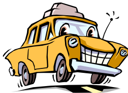
Be careful out there!

You've been there before: you're on your way to your customer's destination and someone cuts you off in traffic. You step on the brakes and screech to a halt. Did you stop fast enough?